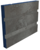
Panel with Grooves