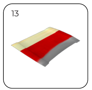
Car Hood Repair