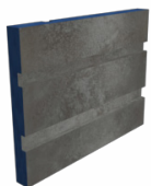
Panel with Grooves