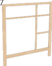
Cabinet Frame Medium