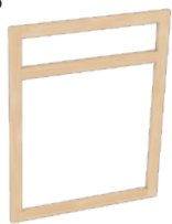
Cabinet Frame Small